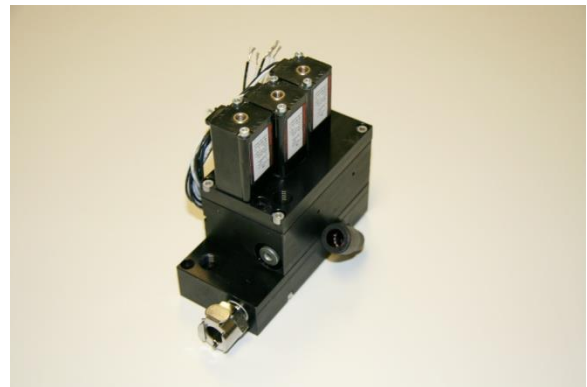
High CV Manifold Description of Components