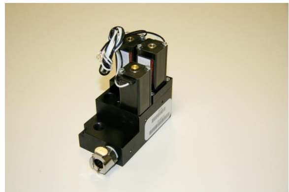
Standard CV Manifold