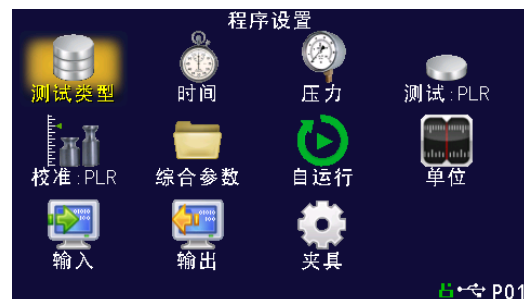
Multi Language Software