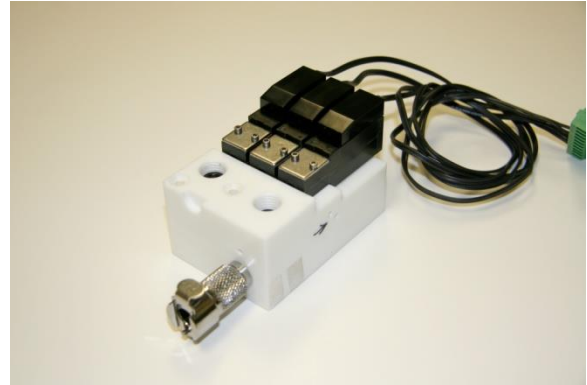
Low Volume CV Manifold