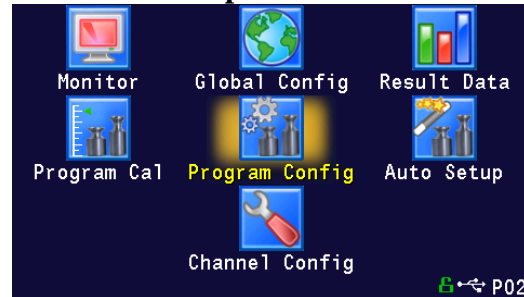
Icon Menu Set-up Screen