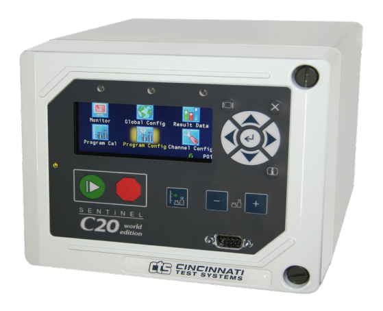
Sentinel C20 leak test instrument