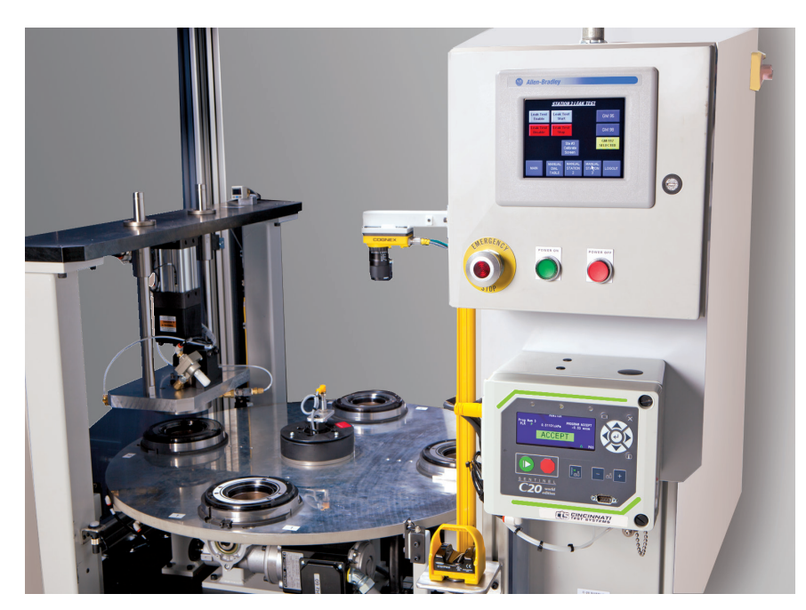
C20 integrated into an automated test cell